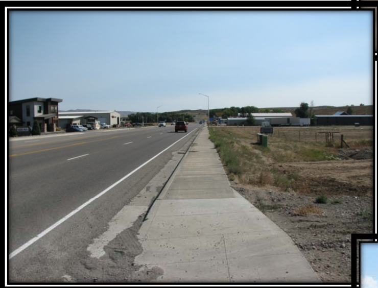
Big Horn Ave / Hwy 14 Looking East