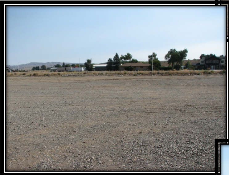
View to the East