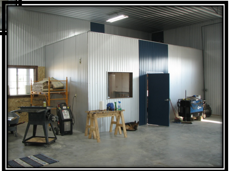
Door into Office