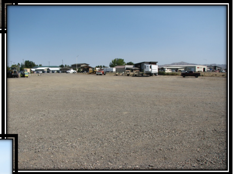
View to the Northeast