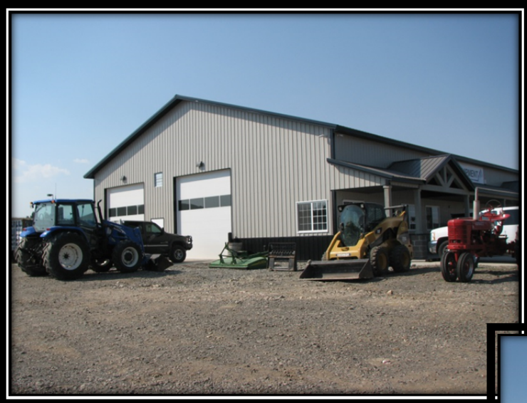
East Side of Building