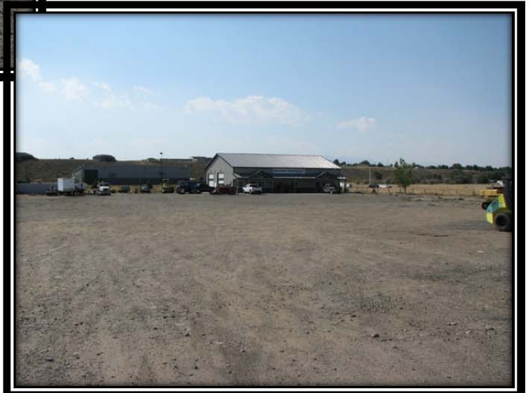
Looking from Big Horn Ave