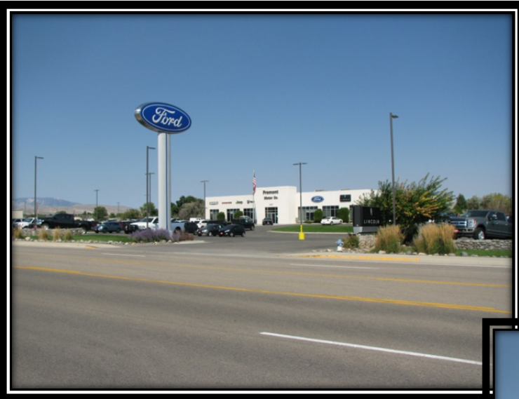
Neighbors Across Big Horn Ave