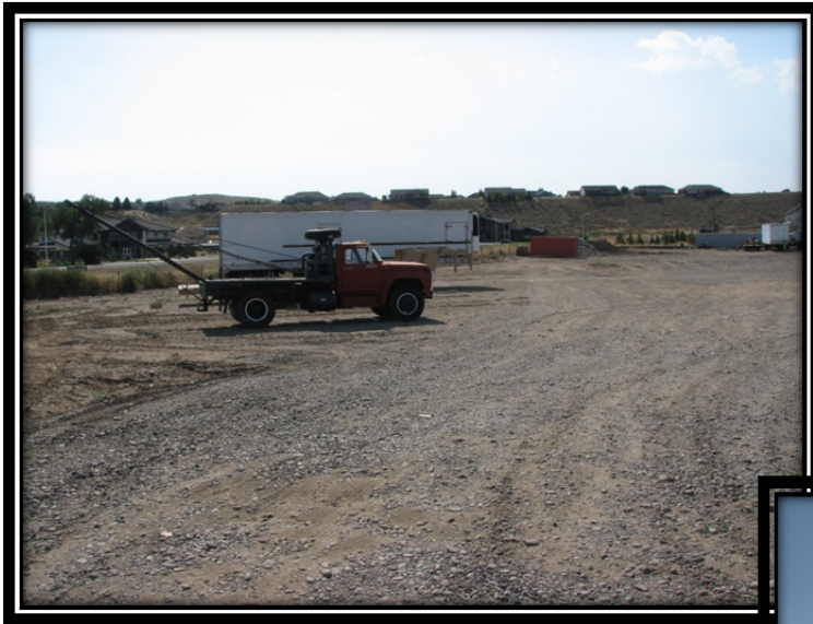
View to the South