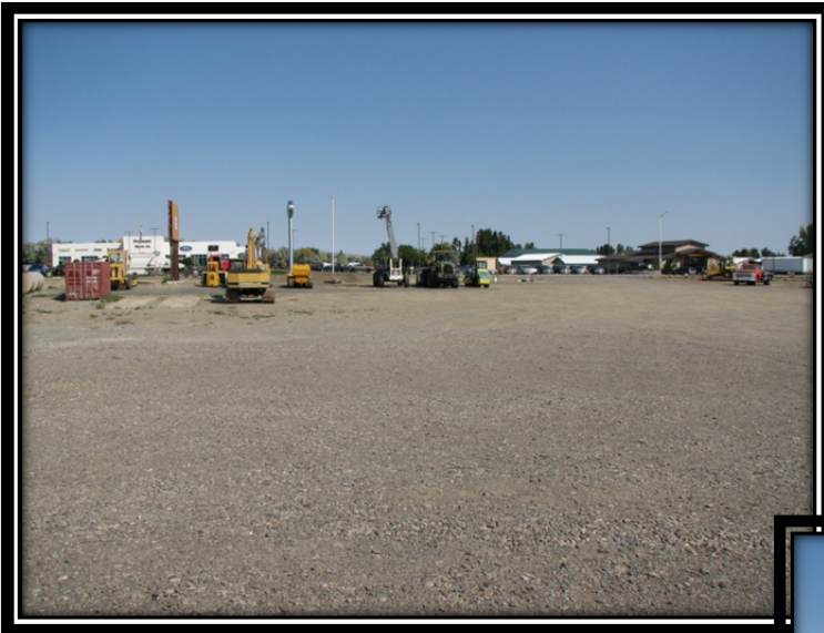
View to the North Across Big Horn Ave