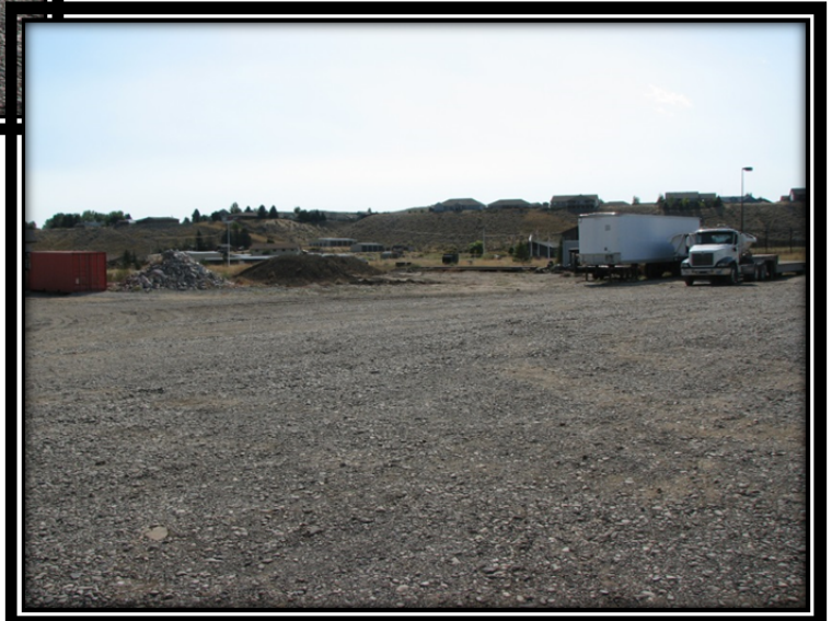
View to the Southeast