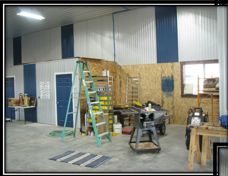
Doors to Bathroom & Utility Room