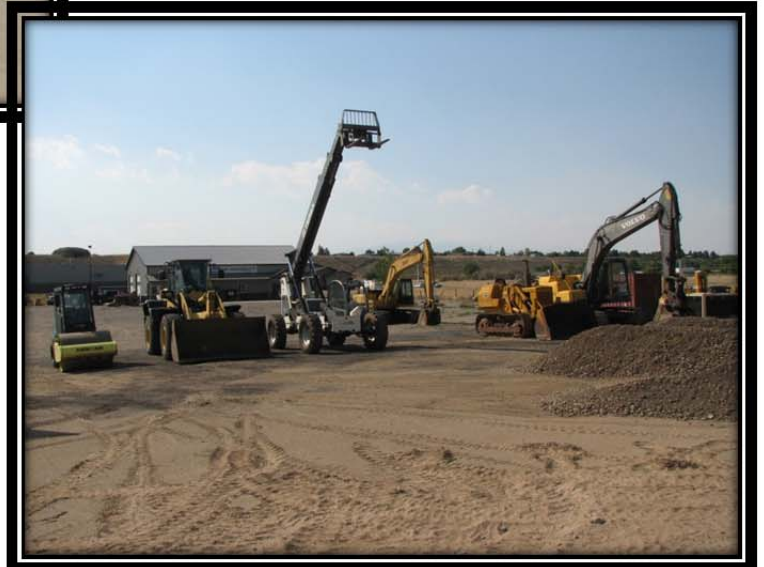
View of Property